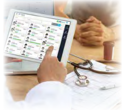
Flexible, efficient, on-site Patient Data Capture

eCaseLink eSource provides a secure, flexible, and convenient approach to on-site patient data capture. eSource can be used as either a standalone or a harmonized EDC platform. eSource is an electronic data capture (EDC) tool designed for real-time, real-site, anywhere data collection situations, such as in operating rooms, clinics, or within a doctor's office. eSource is built for all web-connected devices including iPads, mini tablets, smartphones and desktops. eSource enables your clinical trial personnel the freedom and flexibility to enter clinical data anytime-anywhere removing the need for source data verification and dramatically decreasing monitoring time and costs.