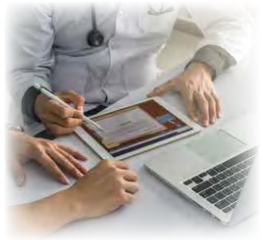
Flexible and Convenient Patient Data Capture

eCaseLink.Me provides a flexible and convenient approach to patient-reported data capture. eCaseLink.Me can be used as a stand-alone application or in combination with eCaseLink EDC software, for reporting and data analysis, saving valuable time at study sites. It also ensures that data gets to clinical researchers faster for analysis and follow up. With its patient-centric design, eCaseLink.Me allows clinical study participants to personalize and change the appearance of the application to better suit preferences. It works on any browser or web-enabled device, so that patients may enter data conveniently from any Wi-Fi-enabled location – no need for unfamiliar devices. Save time and money with lower support costs and no device provisioning costs.