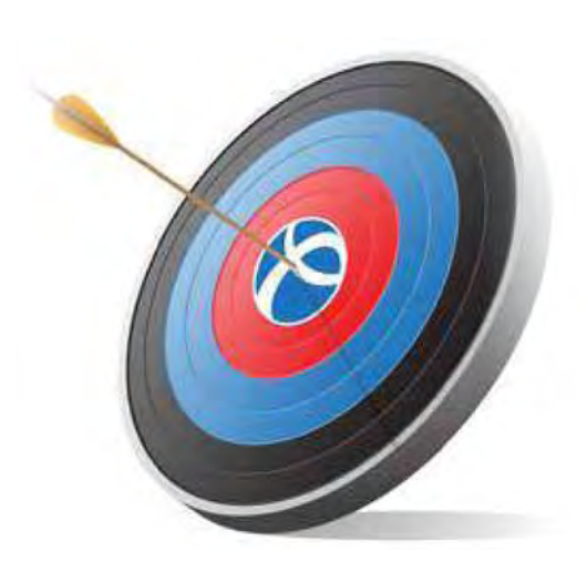
There is fast, and there is DSG FAST

You need an electronic data capture (EDC) solution to be agile, super fast with zero down time, cost-effective, and very easy to use. In such a competitive industry, you want a solution that integrates with your clinical trial management system (CTMS), interactive response technologies (IRT), and many more products, which may be sourced through single or multiple vendors. At DSG, we offer trial sponsors and CROs the flexible, adaptive technology and dedicated support they need to bring new life-changing drugs and therapies to market with complete regulatory approval.